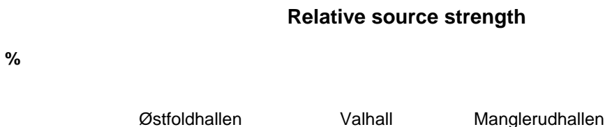
Figure 1: Relative source strength for benzothiazole in the artificial turf granulate.

A degassing test was carried out to compare the source strength for the rubber granulates. Rubber granulate samples (2g) from each of the pitches were stored in a 100 ml Pyrex glass bottle for equal periods of time at 23^\circ\text{C} . An adsorption tube was placed in each of the bottles to take samples of the degassed compounds. In such a test, each individual volatile compound will act according to its own physical and chemical properties. To obtain a simple overview, benzothiazole was chosen as an indicator component because it is a typical rubber component. The results are shown in Figure 1. The values have been normed in relation to Valhall, which gave the highest values. Manglerudhallen gives off 82% compared with Valhall, while the granulate in Østfoldhallen gives off 27%. The results correspond well with the actual measurements shown in Table 6a.